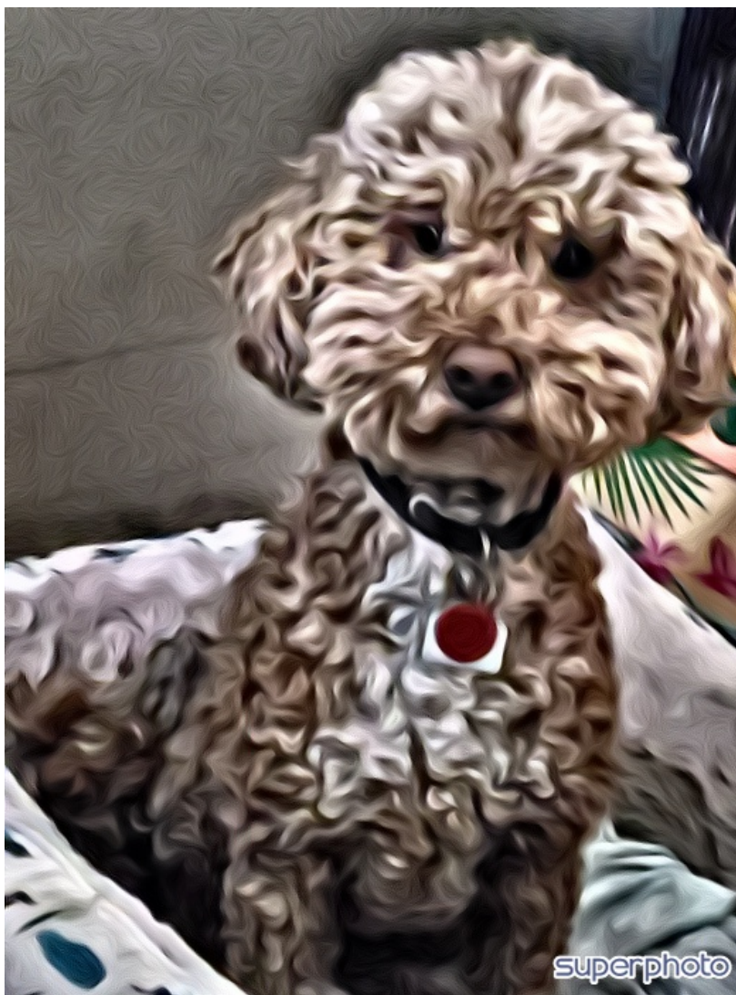
“Rudy Doodle” Grace Gallo’s Miniture Golden Doodle

Congratulations to everyone included in the Monday Memo! The department recognizes your hard work and dedication. Keep it up